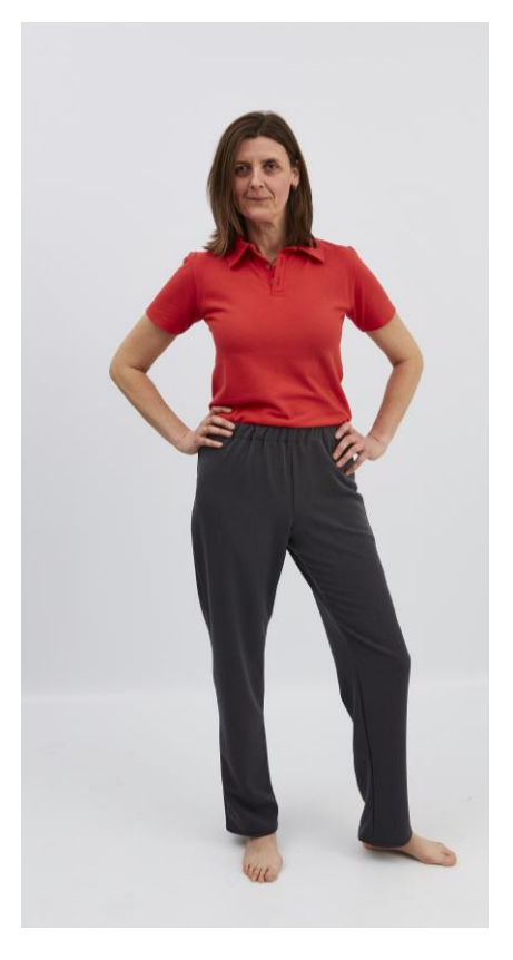
Md 31906<sup>TS</sup> Polo with short legs, short sleeves, zipper between the legs, S-XXL. Colours: navy blue, sky blue and red.